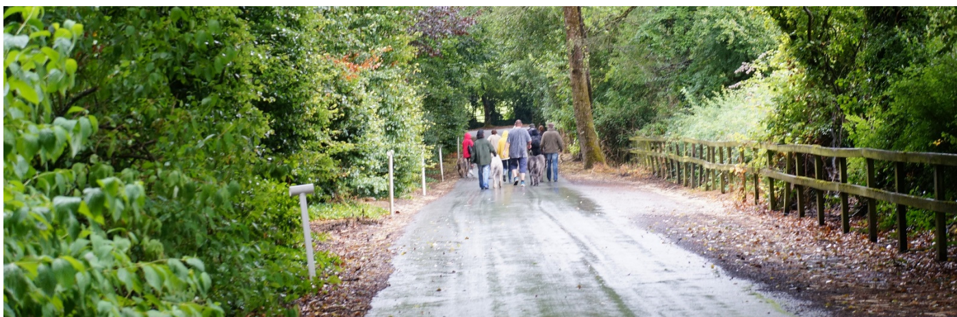
Members survey the multi-surface tracks & long gallops where all the serious training happens.