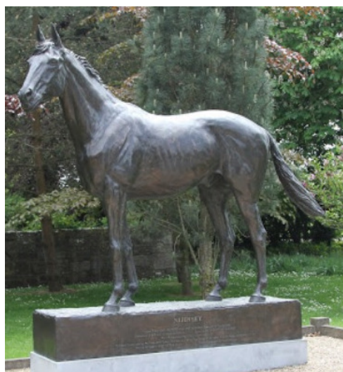
Nijinsky at the gates of Ballydoyle