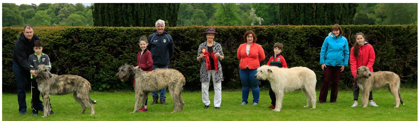
The junior handling competition