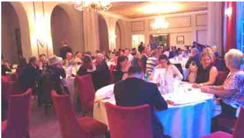
The congress gala dinner held on the evening before the show